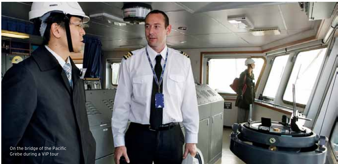
On the bridge of the Pacific Grebe during a VIP tour

In the unlikely event of a ship getting into difficulty, a fully trained and equipped team of marine and nuclear experts is available on a 24-hour emergency standby system, in line with IAEA requirements. The world's leading salvage experts, SMIT, are also contracted to support any unforeseen circumstances PNTL ships may face and the ships are equipped with a specialist system to assist in their location and subsequent salvage, should the unlikely need arise.