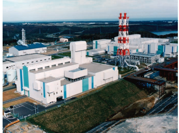
Rokkasho-Mura Storage and Management Facility in Japan

Vitrification is employed by several nations to immobilize radioactive material. Vitrification integrates the radioactive material as part of a solid glass structure that maintains it in a passive form. Vitrification also reduces the overall volume of material that requires disposal.