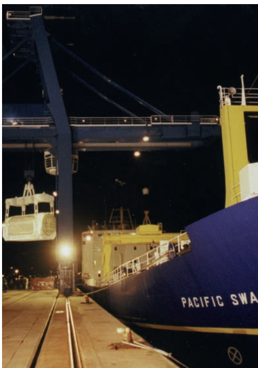
Loading a cask of vitrified residue onto a PNTL ship

Sea shipments of vitrified high level waste are an important part of the infrastructure for providing safe and clean nuclear energy in our modern world. In turn, nuclear power plants make an increasing contribution to global efforts to reduce emissions that could be affecting the world’s climate.